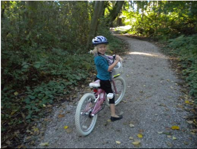
~ On the trail to Carl Cozier School ~

When: Friday, May 21, 2010. 6:30 AM - 9:00 AM